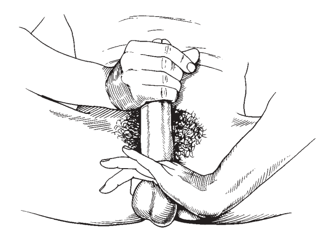
FIGURE 9. SCROTAL TUG

Many sexologists recommend squeezing the penis, a technique that was originally developed for men who ejaculate "prematurely." It is simple. Just place the first two fingers of either hand on the underside of your penis, place your thumb on the top, and squeeze (see figure 8a). Some men also find that gripping their penis like the handlebar of a bicycle and pressing down on the tip or underside with their thumb helps them reduce their arousal (see figure 8b). Although these techniques can be effective in solo practice, they are awkward when having intercourse because you must withdraw. To prepare for this situation, you can try using your mind to help squeeze the tip of your penis. Eventually, you will be able to squeeze the tip of your penis with just your mind and will avoid the clumsiness of having to use your hands. Another good technique is squeezing at the base of your penis (remembering to also squeeze with your mind). This will help you control your arousal and will also expand and strengthen your erections (see figure 8c).